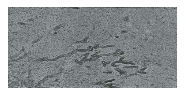
Figure 4 Aspergillus species. PAS stain X 400

Section of the kidneys showed marked vascular congestion, focal tubular necrosis with hylaline and pigmented casts consistent with shock (hypovolaemic and endotoxic). Periodic acid Schiff (PAS) stain of the fungus demonstrated the distinct dichotomous acute angle branching of septate hyphae with orientation of the branches in similar direction (Figure 4). The postmortem diagnosis made was disseminated invasive aspergillosis and endotoxic shock.