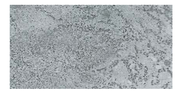
Figure 2 Abscess in the lung with mycelia growth. H & E stain. X100

The lungs showed vascular congestion and oedema with multiple circumscribed nodules composed of masses of fibrinoid necrosis admixed with fungal colonies (Figure 2).